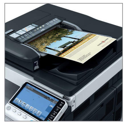
STANDARD DUAL SCANNER up to 180 opm

so that limits can be set on a user-by-user basis. The new products are equipped with a remote control panel to give administrators access to the devices via a web browser.