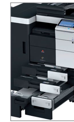
9.5" MULTI-TOUCH CONTROL PANEL