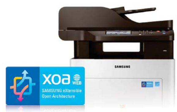
*Supports SL-C3060FR only

Get connected to printing solutions with the XOA-Web. The fast and easy integration of solutions will help your business run more efficiently and smoothly.