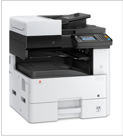
d-Copia 255MF in standard configuration