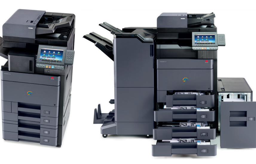
d-Color MF2553/ d-Color MF3253 with DF-7110 finisher, BF-730 folding unit, DP-7100 original feeder, PF-7100 double drawer, NK-7100 numeric keypad, and PF-7120 side drawer