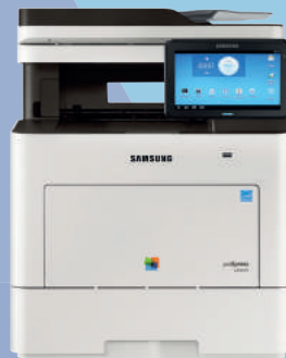
C4060FX (40 ppm)