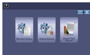
Printer Management: Get quick access to machine status, settings and reports.