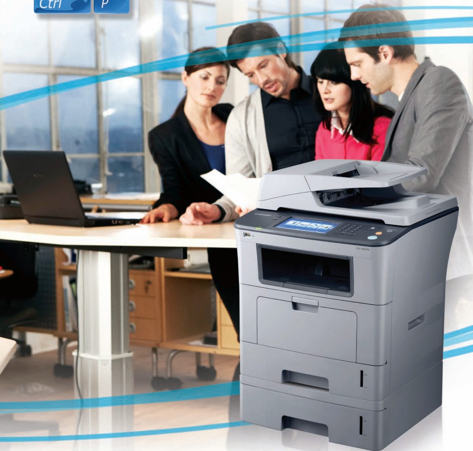
Samsung Multifunction Laser Printer SCX-5835FN