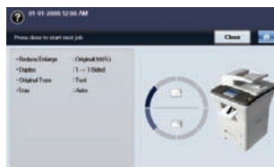
In Operation: Ready screen information minimizes the guesswork.

Breeze through the many functions with a simple-to-use interface. General help can be obtained through the handy “User Tips” feature. To further reduce guesswork, you can also instantly pull up a display of the complete menu flow and organization.