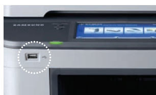
USB Port 1: Located in front for easy and direct access.

Change the way you look at printers, and how you work, with the outstanding features of the SCX-5835FN. A Direct USB port turns it into a self-functioning PC to save time and effort, letting you print and scan directly with a USB drive. The SCX-5835FN is a veritable scanner, with an innovative white LED scanner that scans documents faster and in a higher quality compared to other conventional models.