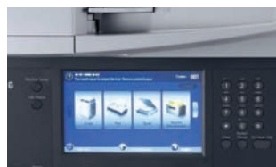
LCD Window: Large display with direct-access menu options.

With the enhancements in place, you can view the entire menu in one glance—this intelligent menu can also be customized to your needs for increased efficiency. While in operation, the on-screen information is also streamlined to individual work processes. When a problem arises, find the fix through simple guided instructions and graphics.