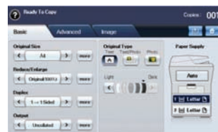
Function Options: Customizable to your needs for improved efficiency.