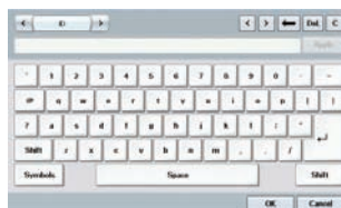
Touch Keyboard: Streamlined to ease individual work processes.