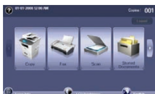
Main Menu: Find everything you need in just one glance.

With the enhancements in place, you can view the entire menu in one glance—this intelligent menu can also be customized to your needs for increased efficiency. While in operation, the on-screen information is also streamlined to individual work processes. When a problem arises, find the fix through simple guided instructions and graphics.