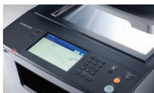
Control Panel: Clean, uncluttered and easy to navigate.

Simplify tasks with a 7-inch colour LCD touch screen that does away with unattractive physical buttons and adds to surrounding décor. Information is displayed clearly and concisely, with most menu options accessible directly from the LCD. Intuitive navigation minimizes operation time. Every second saved counts towards increasing productivity.