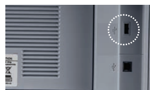
USB Port 2: Additional side port.