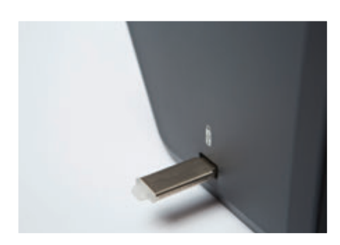
The scan to USB host feature allows the connection of an external storage flash drive up to 64 GB so users can instantly make their scanned documents portable.