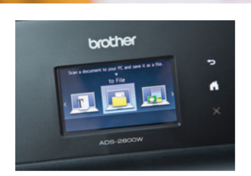
Secure Function Lock (SFL) allows user restrictions to be put in place for function management and improved security.

Offering true network capability, business critical information can be sent directly to a desired Network folder location, improving workflow efficiency and increasing productivity. The ADS-2800W also supports programmable scan destinations from the 9.3cm colour touchscreen, for instant, one touch scanning.