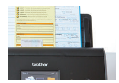
Efficiently process a wide range of mixed document materials, paper weights, colours, sizes and also plastic cards